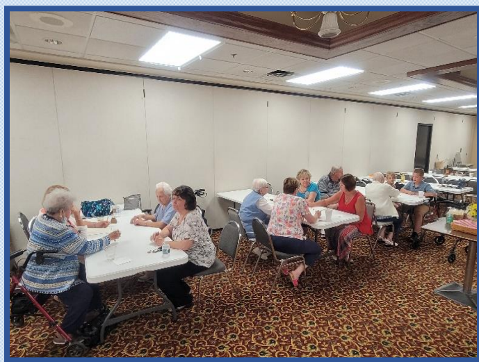
Members enjoying a game of buncle