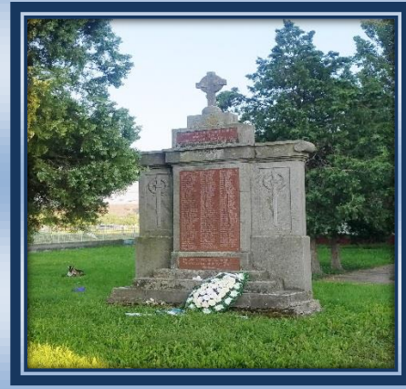
Memorial Stone with names of Lieblingers who died in Liebling.