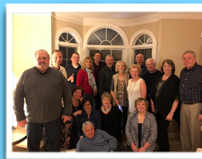
Die Freundschaft geht Majen.