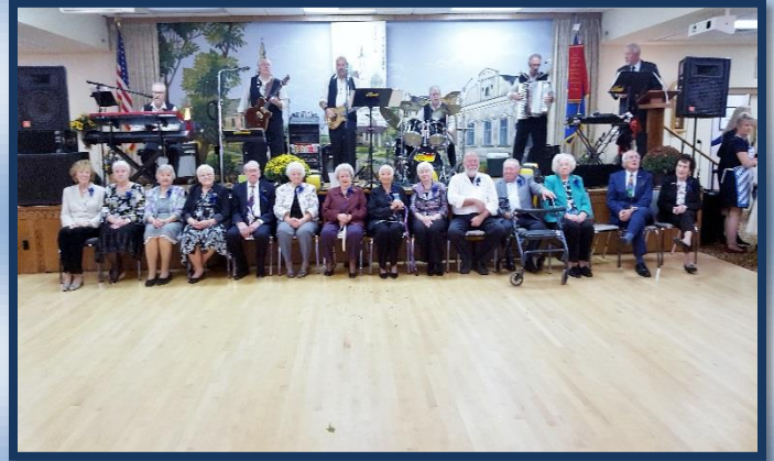
Our Senior Members being honored at the Kirchweih

Below is a Preview of some of the pictures that will be featured in our Pictorial Issue: