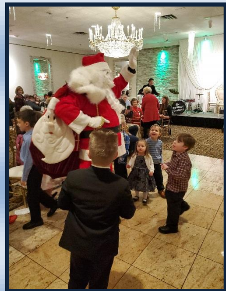
Families Enjoying the Liebling Christmas Party: