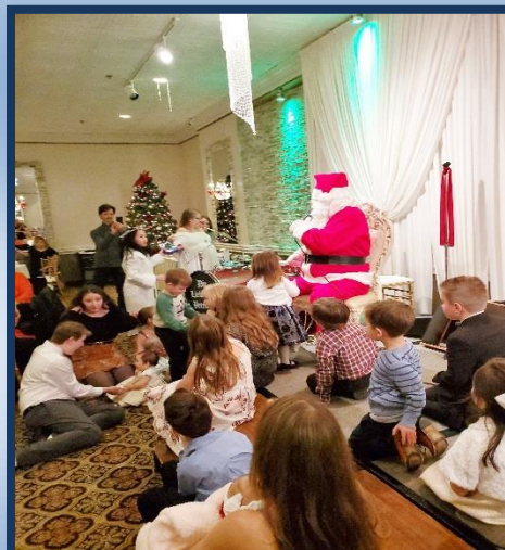
Santa Claus and the children