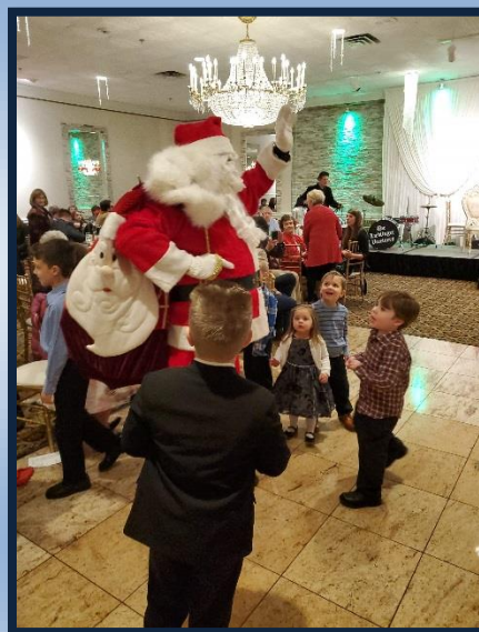
Families Enjoying the Lieblinge Christmas Party: