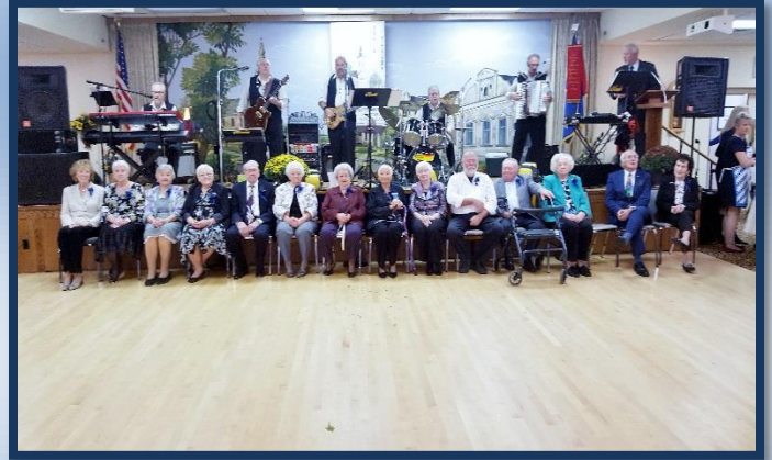
Our Senior Members being honored at the Kirchweih

Below is a Preview of some of the pictures that will be featured in our Pictorial Issue: