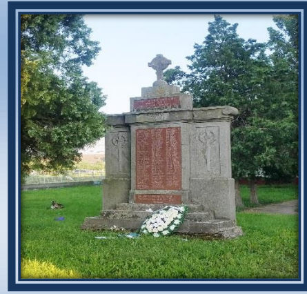
Memorial Stone with names of Lieblingers who died in Liebling.

Upcoming Events : Lieblinger Meeting/Family Picnic - August 11 Schwaben Oktoberfest- August 16,17, 18.